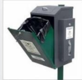
Particolare apertura per sostituzione sacco