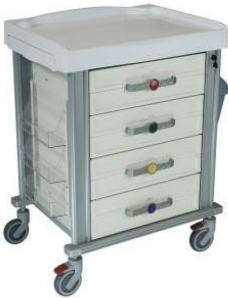
Colori disponibili per cassetti